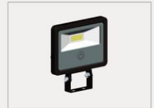
Tree Hanging Mounting