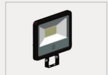
Tree Hanging Mounting