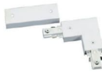
K610 Single Circuit 90° Connector Finish: WH/BK