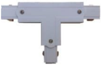
K609 Single/Two Circuit T-Connector Finish: WH/BK