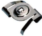
K604 T-bar Attachment Clips For T-bar Drop Ceiling Finish: WH/BK/SN