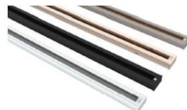
K5-3 Single Circuit/Two Circuit Track Single circuit track is rated for 2400W features 12-gauge copper conductors and

a separate ground conductor. Two circuit track includes 12-gauge copper conductors and features a double load capacity at 4800W max. Single/Two Circuit Track is available in white,black,and satin nickel finishes,and in 4,6,and 8-foot sizes,and can also be field cut to your preference.