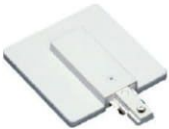
K606 Single/Two Circuit Live End With Box Cover Finish: WH/BK