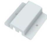
K605 Single/Two Circuit Floating Canopy Finish: WH/BK