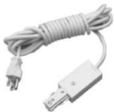
K612 Live End With Cord&Plug Finish: WH/BK Available in 2 wire,3 wire,4 wire