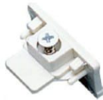
K607 Track End Cap Finish: WH/BK