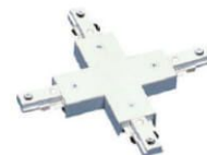
K611 Single/Two Circuit X-Connector Finish: WH/BK