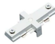
K608 Mini Coupling Finish: WH/BK